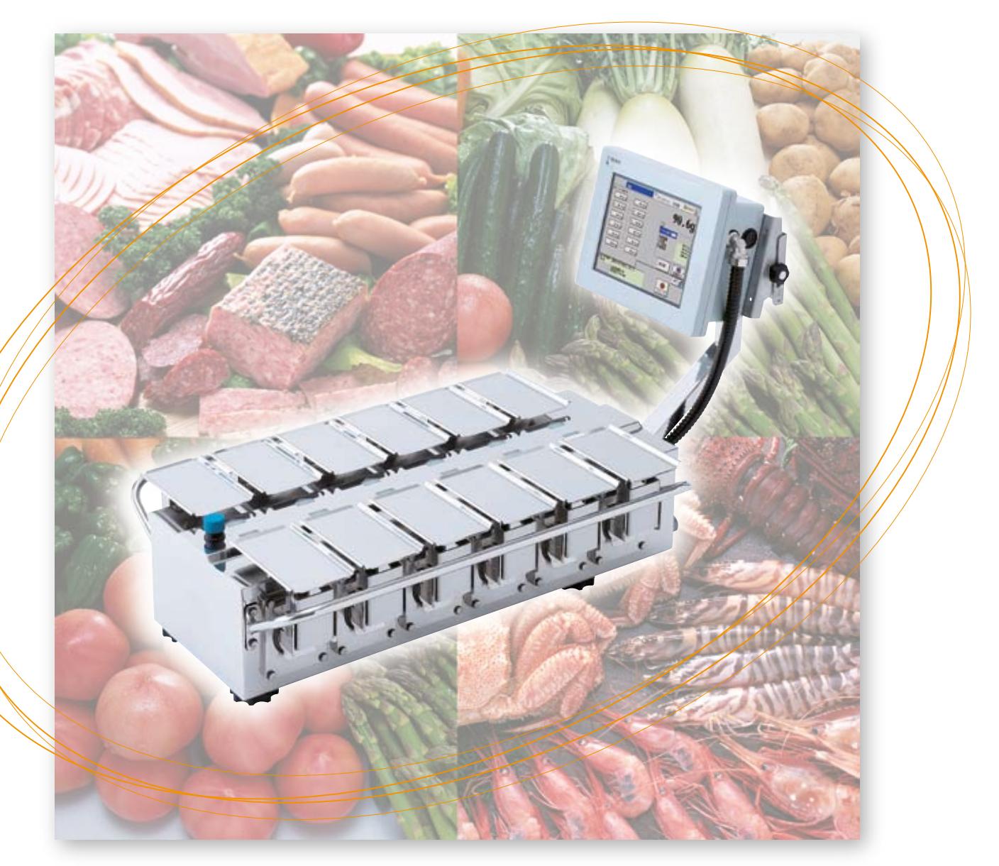
Table-top Multihead Weigher NFC SERIES