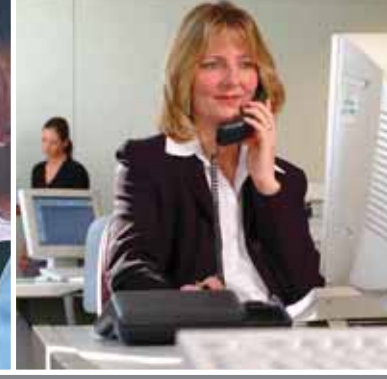
helpline • spares • service • training