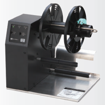
WIND UNIT (BP-RW)