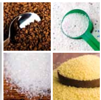
For highly accurate weighing of dry, free-flowing granular product