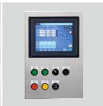
7 inch colour touchscreen displays performance data