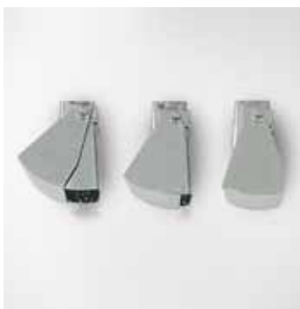
Precise opening and closing control