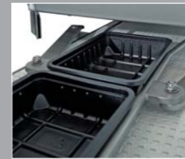
Fast, reliable denesting at 120+ trays per minute