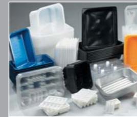
Trays and pots of any shape, size or material