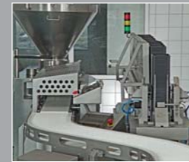
Easily integrated into any solution