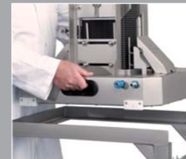
Rapid, tool-free changeovers