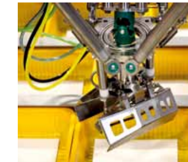
Unique gripper design enables super-fast orientation and placing of pieces