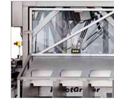
Hygienic all stainless steel construction

Another important factor is the speed and precision of the unique robot hand (see inset).