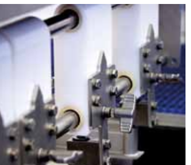
No tools needed for dismantling