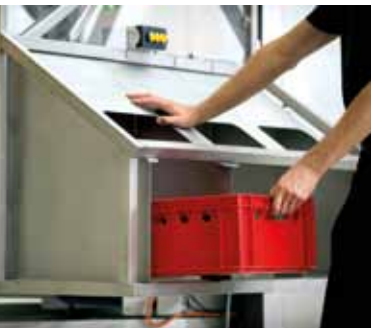
The system can also select product for bulk packing into crates