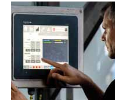
Easy-to-use, informative touchscreen interface