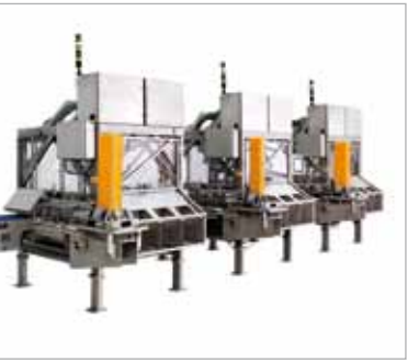
RobotGrader is 20-30% shorter than a traditional sorting system

RobotGrader is an original and highly effective idea. However it is also robust. It combines dynamic weighing, an art which has been around long enough to attain near-perfection, with modern robotics and well-tested weight algorithms. It does not rely on vision technology, with its high demand for computer programming and updating.