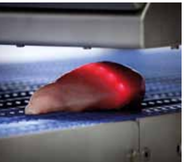
Simple, reliable orientation determination based on photocells