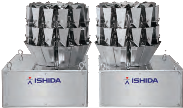
Optional off-set body design : To position two machines closely for 2-mix weighing applications.

No other multihead weigher supplier can match the innovation track record and global installed base of Ishida and this pioneering spirit has gone into this new innovation. The “Micro”, the tiny but strong multihead weigher delivers the most flexible production solution within the smallest footprint whilst still delivering highest productivity and lowest product give away.