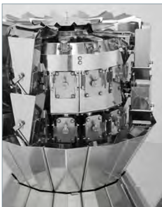
Minimal gaps at product transfer points